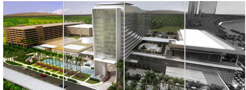
Solaire Resort & Casino

Small project over a month concerning Junket Business Models in Macau.