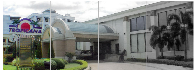
Tropicana Resort & Casino, Cambodia

Golden Crown Casino, Cambodia March 1998 to September 1999